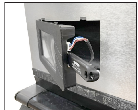
Fig. 2. Display USB port and cable locations.