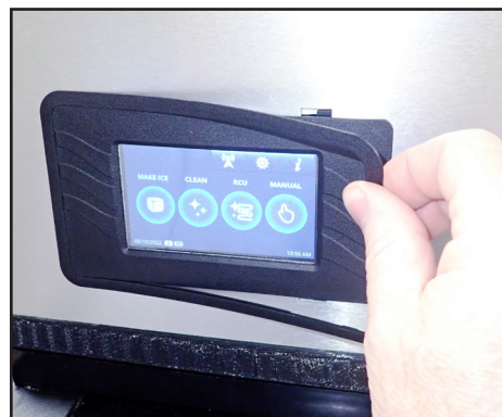
Fig. 1. Pull the display ring from the unit.