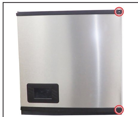
Fig. 3. Front panel screw locations.